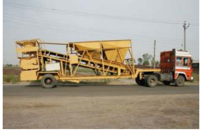
OPTIONAL TRAILER CHASIS